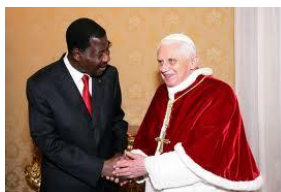
President Yayi & Pope