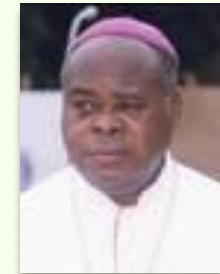
Archbishop de Souza

Representative of all religions and the people Symbol of spirituality